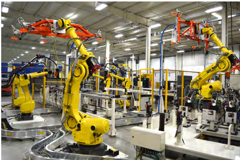
Large scale robotic system that integrates welding, dispensing, assembly, and material handling technologies to produce an automotive part.