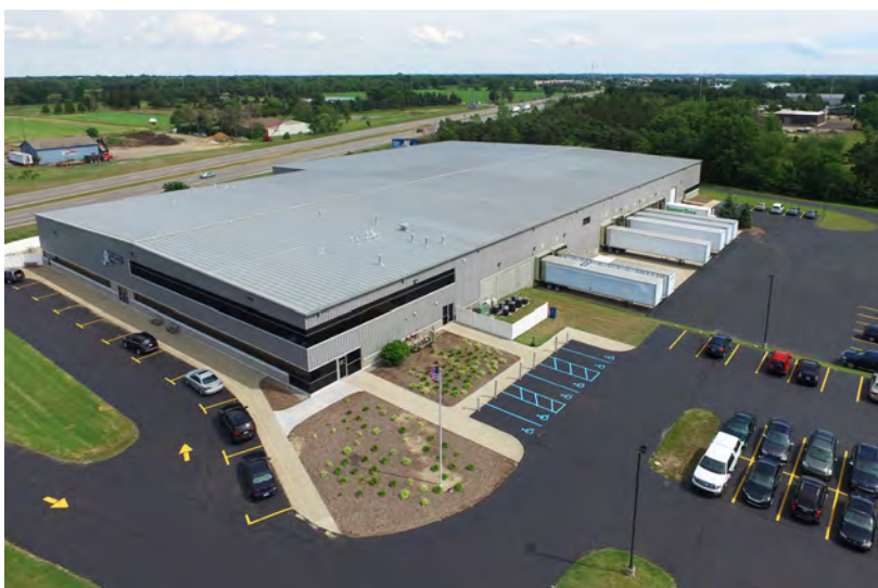
Aerial photograph of JR Automation's executive headquarters, located at 4190 Sunnyside Dr., Holland, MI 49424.