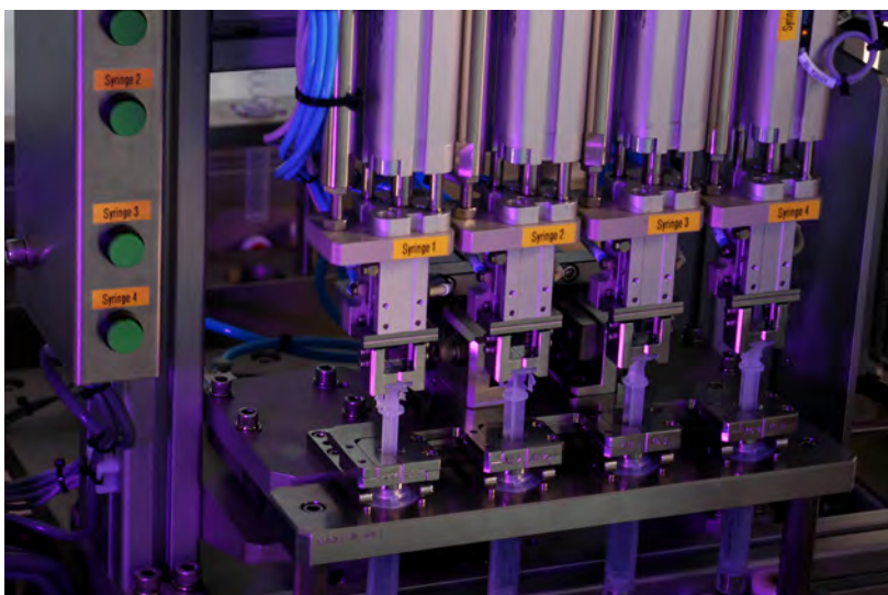
Close-up image of an integrated system developed for a customer in the life sciences industry.